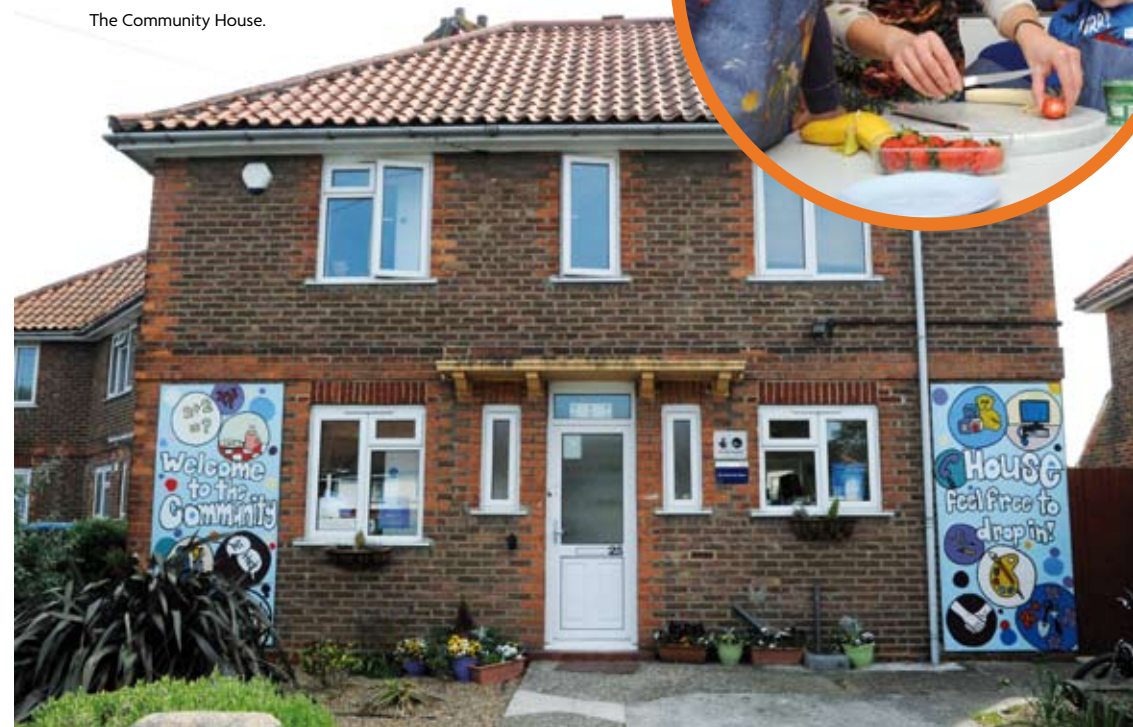
The Community House.

All staff can contribute and influence the decisions that affect them through our staff consultative group. The group meets regularly, is chaired by our human resources adviser and is attended by the senior management team. The group consists of staff members who represent each team, and contribute to staff policies/decisions.